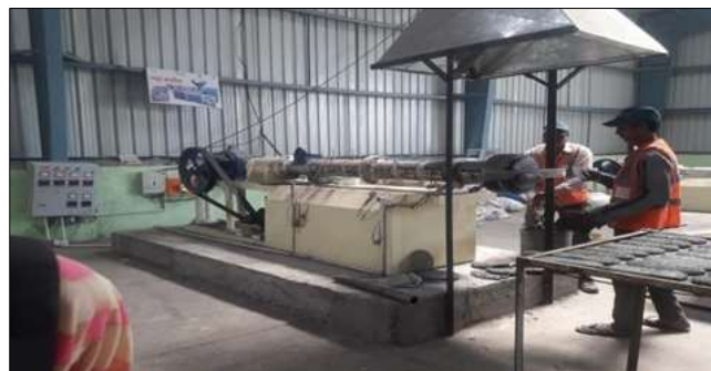
Fig 1: Briquetting (Gatta) Unit

The non-biodegradable waste was segregated by category at the site. The recyclable low- density polyethylene (plastic bags) gets cleaned in phatka machine then shredded by egloo machine and to plastic briquetting (gatta) unit as shown in figure 1, the plastic briquettes are sold to an irrigation pipe manufacturer. Other smaller-volume recyclables such as paper / carton, glass, metals, HDPE, PPP, and PET are cleaned, sorted, bundled and traded to wholesalers at a cost-plus margin.