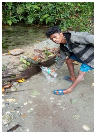
Kunginju Tea Estate B