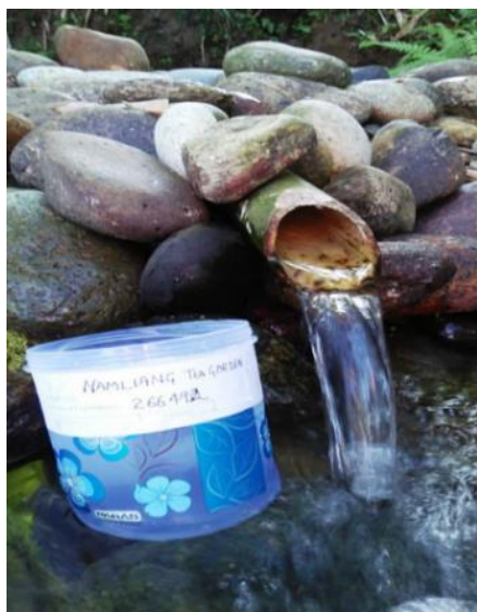
Namliang Tea Gerden, Chowkham Circle