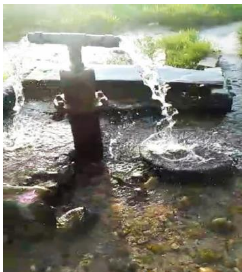
Nongtaw Khampti A, Piyong Circle