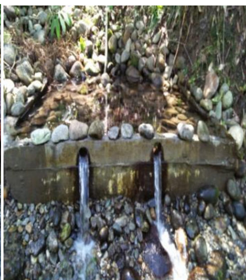
Tissue, Chowkham Circle