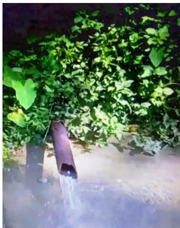
Sapey Kung Tea estate -B