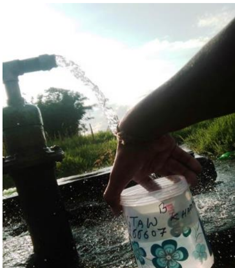
Nongtaw Khampti B, Piyong Circle